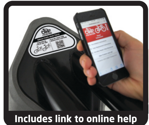
Includes link to online help