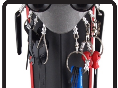
Retractable tools prevent tangling and aid organization