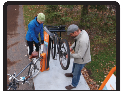
Can service two bikes at once